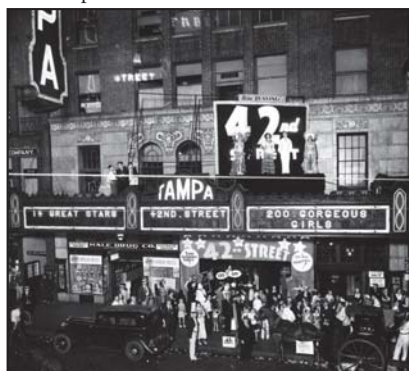
Popular movies like 42nd Street premiered at The Tampa Theatre

The 1920's was a time when cars had cool names like the Ajax Nash, Flint and Rickenbacker. Styles were changing. Dresses became a little shorter and more fun with lighter, pastel shades. Bobbed hairstyles and chic hats completed the look. Men's suits were less tailored with baggy pants and oxford saddle shoes. This new, fun-loving era produced a population of movie goers. Tampa was a growing community and needed a place for people to go when they felt like putting on the Ritz and getting dolled up.